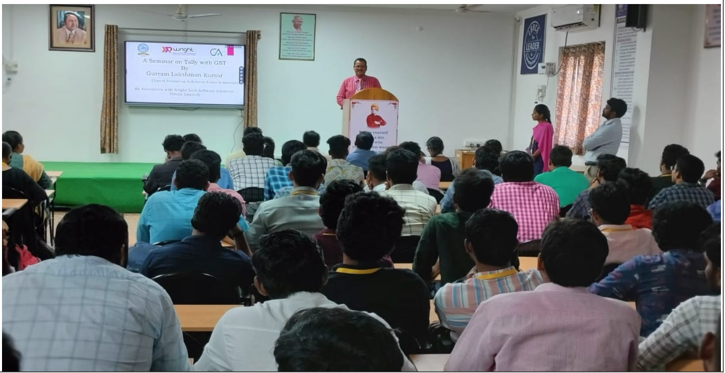
Fig: Students attended for Seminar on Tally with GST